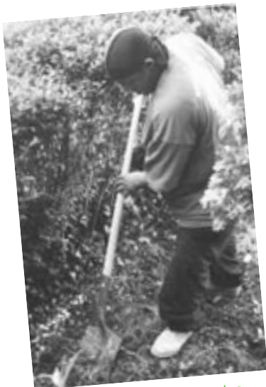
Yard revitalization at a county home.