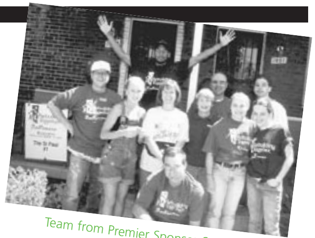
Team from Premier Sponsor St. Paul pauses for a photo.