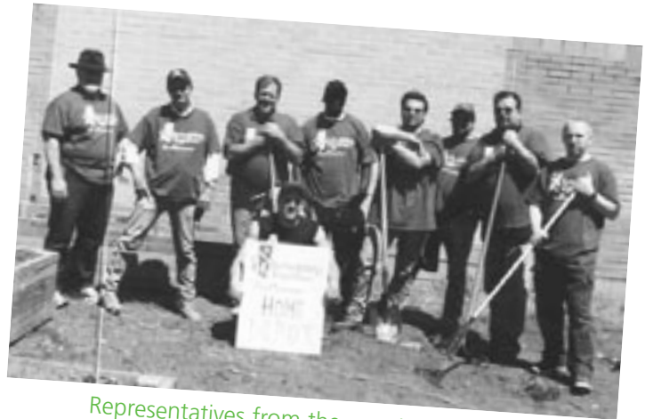
Representatives from the area Home Depots working on the city PAL Center.