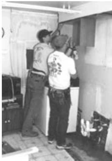
Remodeling a kitchen at a county home.