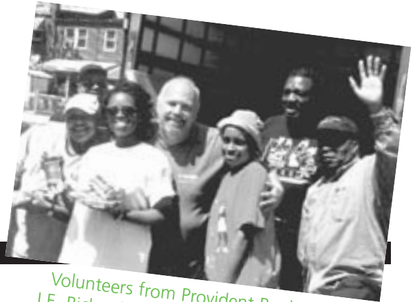
Volunteers from Provident Bank and J.E. Richards Company pause for lunch.