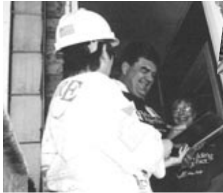
County Executive Dutch Ruppertsberger pitches in on Rebuilding Day.