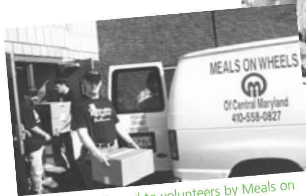
Lunch is delivered to volunteers by Meals on Wheels - a fruitful partnership.